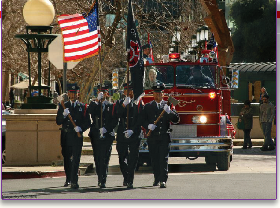
▲ The steel remnant of the World Trade Center was carried from the Chamber offices to City Hall and then was placed in a fire engine with a Fire Department procession to Henry J. Kaiser Memorial Park.

The entire monument, complete with a visually impaired wall with busts of the humanitarians and their quotes in braille, will be dedicated within the next two months.